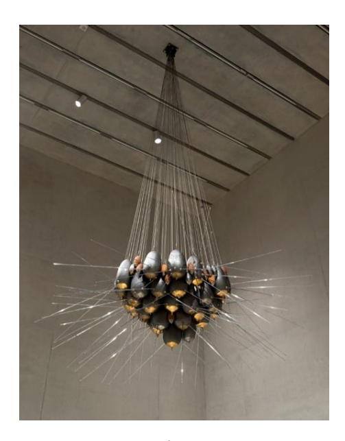
Simone Leigh, trophallaxis, 2008/2017. Terracotta, porcelain, epoxy, graphite, gold and platinum glazes, and antennas, dimensions variable. Pérez Art Museum Miami (PAMM). Museum purchase with funds provided by PAMM's Collectors Council