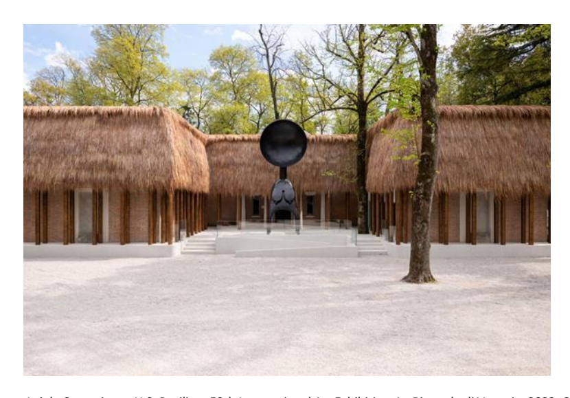
Installation view, Simone Leigh: Sovereignty, U.S. Pavilion, 59th International Art Exhibition, La Biennale di Venezia, 2022.

Leigh's video works, often created in collaboration with other artists, draw from historical and fictional representations of Black women and femmes. In the video my dreams, my works must wait till after hell (2011), Leigh and artist Chitra Ganesh reimagine the reclining female nude, a common subject in European art, from their perspective as women of color. A 2011 collaboration between Leigh and artist Liz Magic Laser, titled Breakdown , features mezzo-soprano Alicia Hall Moran singing a script the two artists compiled from scenes of men and women experiencing nervous breakdowns in plays or television shows, offering a stunning meditation on psychology, race, and gender.