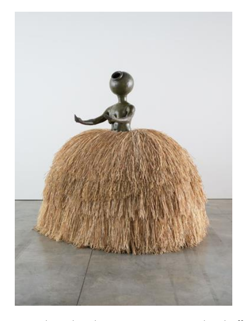
Simone Leigh, Cupboard IX , 2019. Stoneware, steel, and raffia, approximately 78 \times 60 \times 80 inches ( 198.1 \times 152.4 \times 203.2 cm). Institute of Contemporary Art/Boston. Acquired through the generosity of Bridgitt and Bruce Evans and Fotene Demoulas and Tom Coté

In recent large-scale ceramic sculptures, Leigh merges the human body with traditional domestic containers, conjuring unacknowledged acts of female labor. The intersection of architecture with the body is also central to her sculpture, such as the work Cupboard IX (2019), seen in the steel cage-like structures that the artist leaves bare or covered with raffia, evoking the womb, skirts, and sub-Saharan dwellings, often built by women and used as gathering spaces.